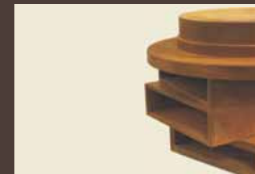
Thomas Scheibitz Grill 2009 (detail), PS metal Steel