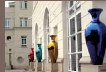
Horst Gläser stainless steel, polished, glazed, painted