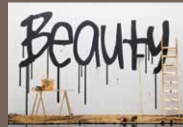
Eckart Hahn chrome optics gold