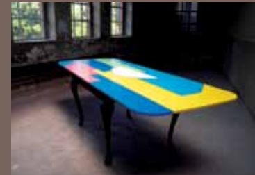
Alessandro Mendini table object, multicolored