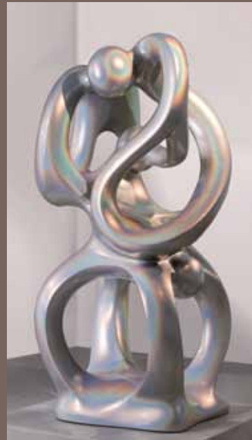
Anselm Reyle bronze sculpture, prism-effect-coating

Before surface application we play it safe: As a general rule we create a surface example on the original material. After the approval we coat the object and arrange all logistic details if necessary in order to guarantee perfection.