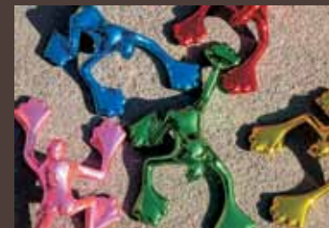
atelier rosalie Flossis, chrome optics, colour glazed