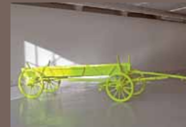
Anselm Reyle neon lacquering